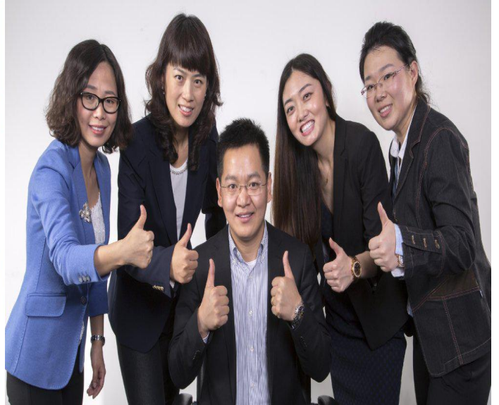
Hometech Shenzhen Sales Team