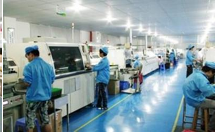
The production line 2