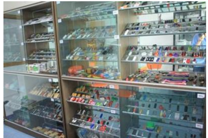
The show room