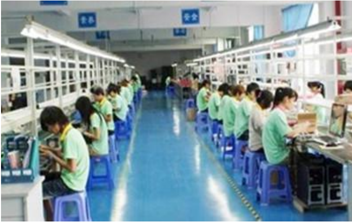
The production line 1