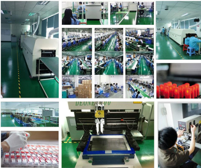
The production line 3